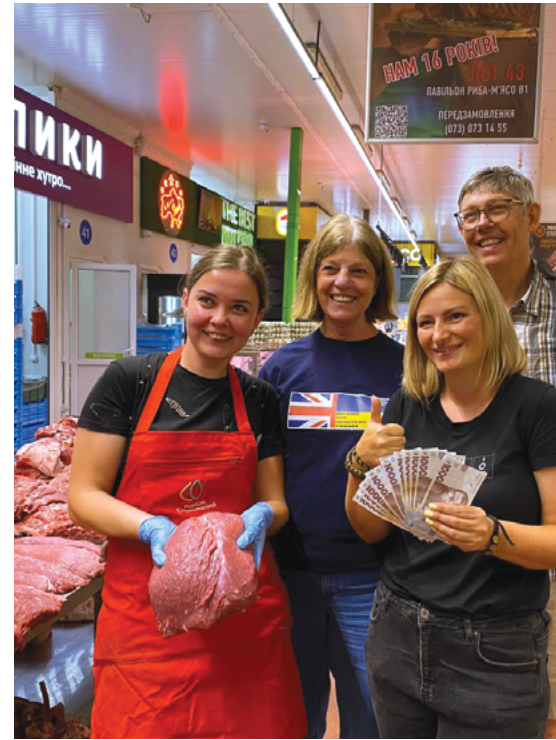
Buying food in Kyiv, September 2024

In early December we were able to send out 18 pallets of donated goods, far more than we anticipated and certainly our largest delivery so far. Many individuals and organisations contributed, but