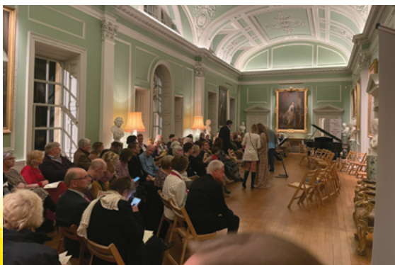
Milton Hall Fundraising Concert, November 2024