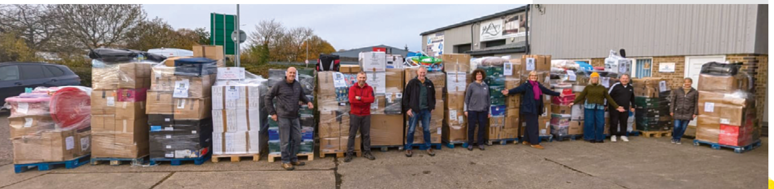
18 pallets on route to Kyiv, December 2024