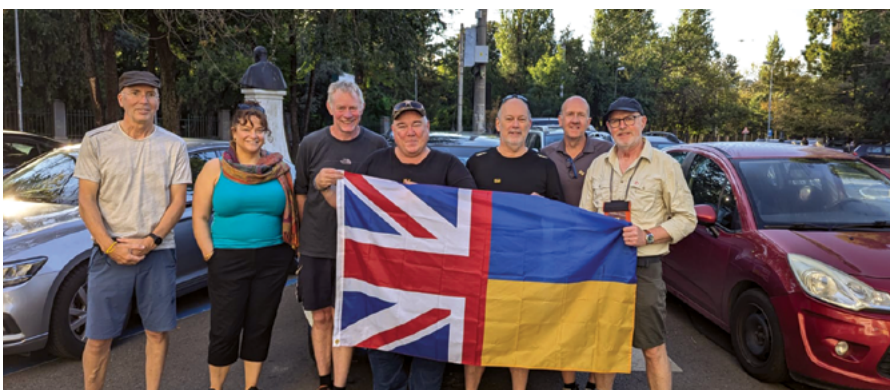
4x4 delivery to Kyiv, August 2024

Sadly, the security situation in Kyiv was judged to be too risky for any of the HOUF team to journey out to help unload the lorry and to buy goods there, but we were able to send a further £9000 to our partners to make that happen.