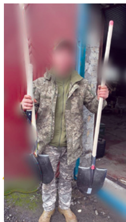
Sustain Ukraine Delivering Supplies to Military Units, 2024