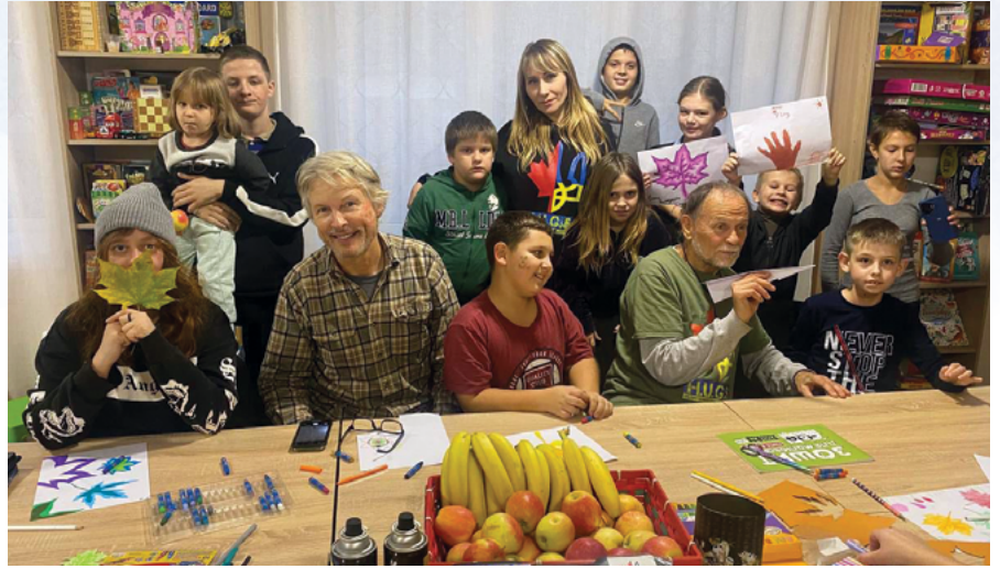
HUGS Smart Kids Programme, Kharkiv

The Cross Charity - we were introduced to Cross Charity by a Ukrainian lady studying English in Peterborough! And what a great introduction that was. Cross make regular trips to just behind the front-line where they set up a field kitchen, making soup and stew for soldiers and members of the community. As a Christian charity they also offer moral and spiritual support. Check out the